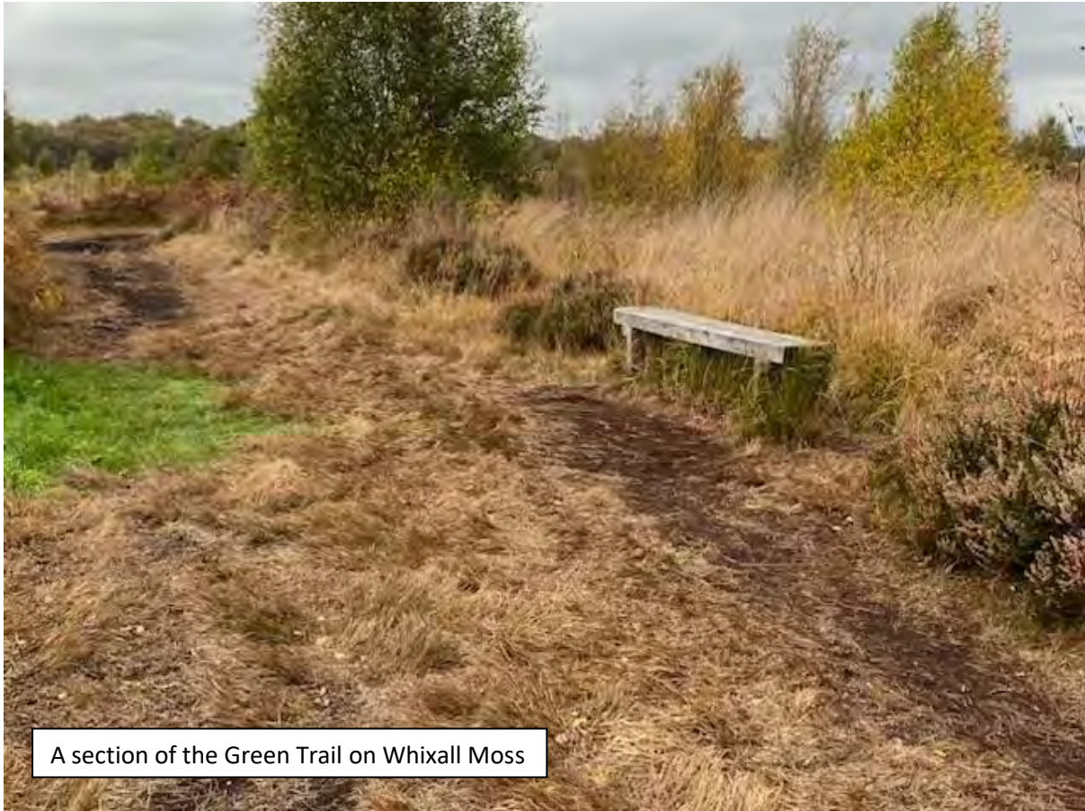
A section of the Green Trail on Whixall Moss

Around the reserve there are public rights of way, including footpaths and bridgeways. In addition to these, there are a number of waymarked permissive trails including the Mosses Trails (3 routes: Green, Orange and Purple colour coding on NNR maps and leaflets), the History Trail and the Bettisfield Moss Trails.