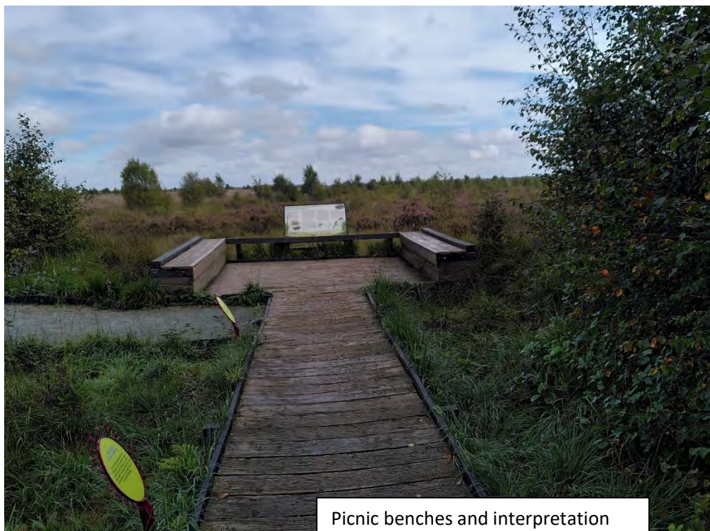
Picnic benches and interpretation panel at the end of the board walk